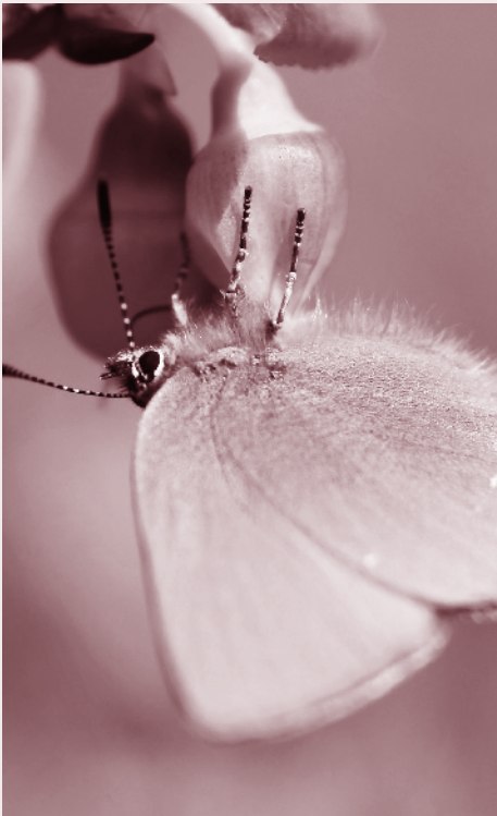
Green hairstreak butterfly.