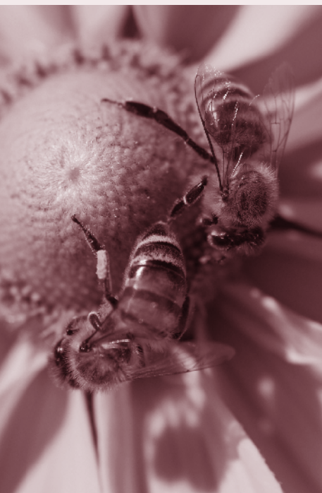
Two bees at a flower.