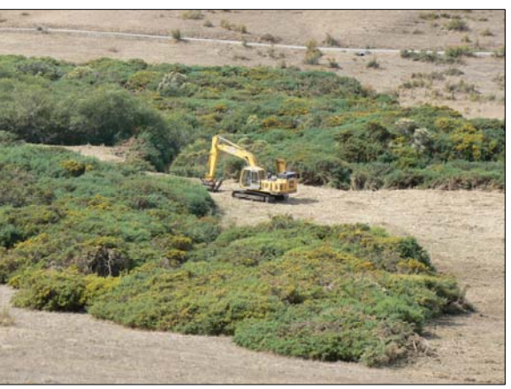
Above: Masticator grinding through a thicket of Gorse in the Estero Americano