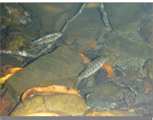
Juvenile coho salmon and steelhead found in Fay Creek summer 2010