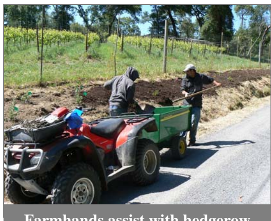
Farmhands assist with hedgerow mulching on Dierke Farms