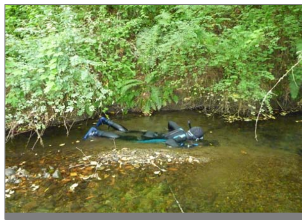
GRRCD Staff Conduct Snorkel Surveys Summer 2010