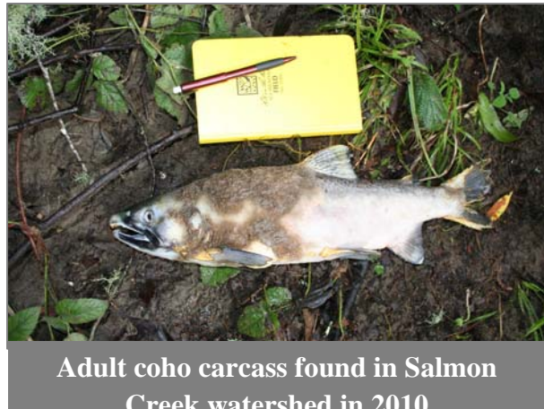
Creek watershed in 2010