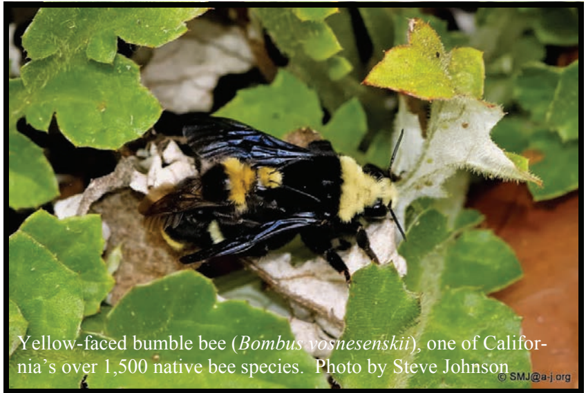
Yellow-faced bumble bee ( Bombus vosnesenskii), one of California's over 1,500 native bee species.

Building on its pilot project launched with a 2009 Conservation Innovation Grant award from the Natural Resources Conservation Service , the Gold Ridge RCD has received additional funding to expand its pollinator program, which works to improve biodiversity on farmland to support native bee species. With matching funds from the Wildlife Conservation Board and the Sonoma County Fish and Wildlife Commission , the project team has thus far installed nearly 5,600 plants on six farm properties, in plantings designed to provide nesting habitat and year-round pollen and nectar sources for bees and other pollinators. Planting days on participating properties have been made possible with the help of dozens of volunteers, including those through the Volunteer Center of Sonoma County, local Cub Scout Pack 134, students from Sonoma State University, and employees from The Fruit Guys, a San Francisco-based company that distributes fresh produce to workplaces.