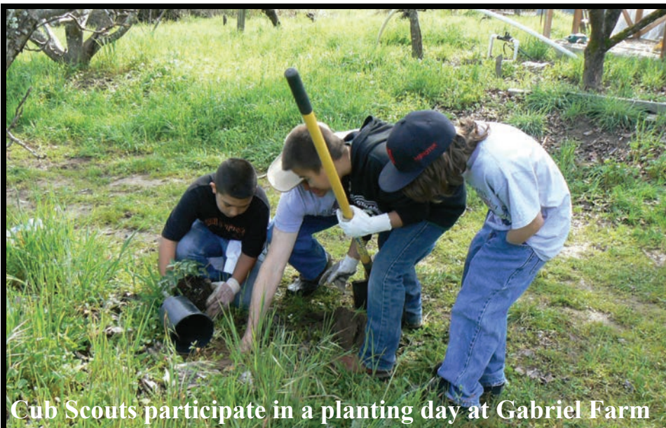
Cub Scouts participate in a planting day at Gabriel Farm